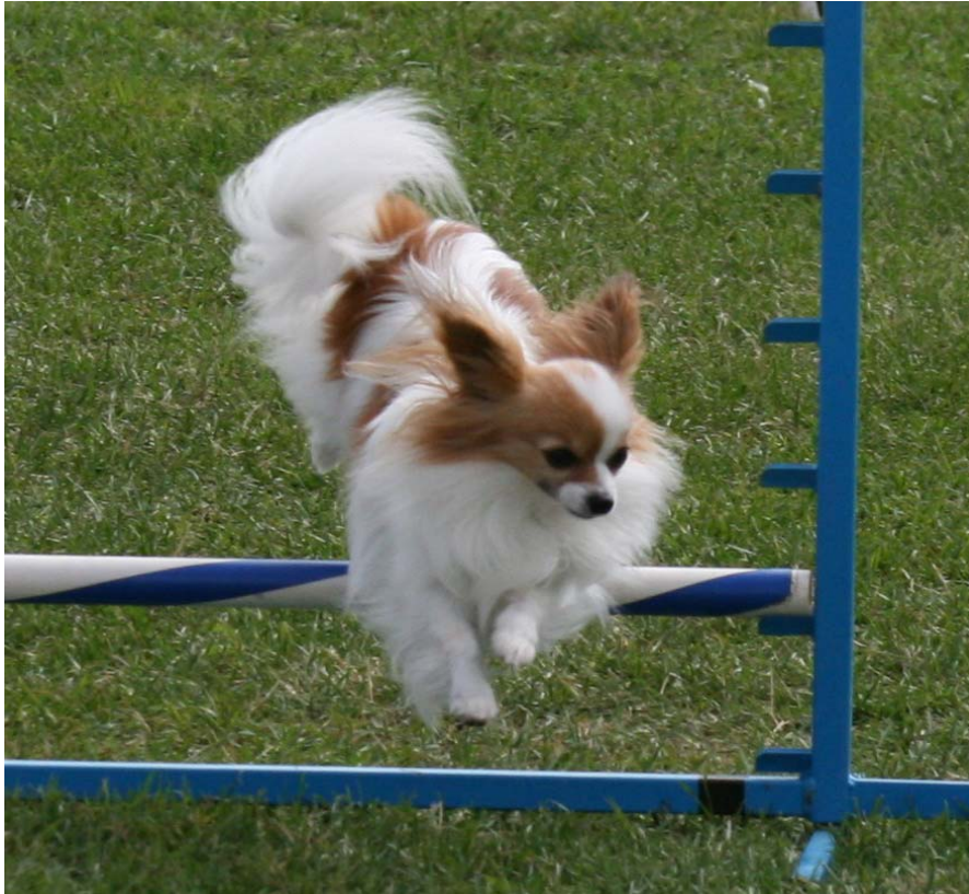
CH MACH Ezee Sweet Confection CDX RE XF "CANDY" 11-15-2000 --- 1-22-2009

The HRKC dedicates this agility trial to two of our members loved companions that passed this last year